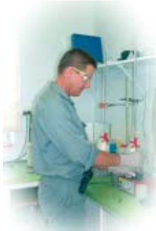
Wastewater Test Lab