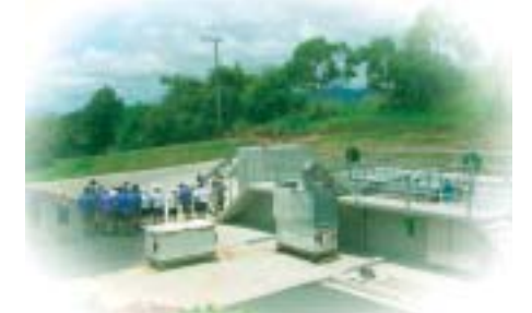
Rotary Drum Screen

The heavier sand and grit settles into hoppers at the bottom of the tank where it is pumped out and buried on-site. The remaining wastewater (or effluent), still containing dissolved nutrients, organic matter, viruses and bacteria, goes to the Primary Flow Divider which splits the flow into two Primary Settling Tanks.