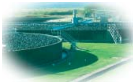
Biological Trickle Filter

Effluent leaves the system by a series of openings at the bottom of the outer wall which also serves to let air into the stone bed to maintain aerobic conditions and passes onto the back two Biological Filters. The wastewater from the front two filters is transferred by pumps to the Secondary Flow Divider where it is split between the back two Biological Filters. This works in the same manner as the front two filters but because the effluent goes through two filters in series, there is more breakdown of organic material and therefore increased efficiency.