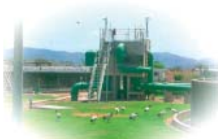
Secondary Flow Divider

This biological community consists mainly of bacteria, fungi, protozoans, worms, insect larvae and snails. The effluent coming from the Primary Settling Tanks is discharged over the top of the filter stone media (Biofilter) by means of the Rotating Arms and trickles down through the slime covered stones. The purification process proceeds continuously provided that aerobic conditions (oxygen rich) are maintained within the bed of stones.