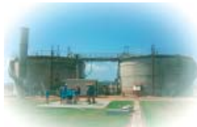
Sludge Digester Tanks

At Mt St John around 50,000 litres of sludge is removed daily. The sludge and scum collected in the Raw Sludge Well is pumped at intervals to Anaerobic Digesters (no oxygen) where the obnoxious raw sludge is broken down by acid-forming and methane-forming bacteria. This breakdown of raw sludge simplifies disposal problems because a substantial overall reduction in the