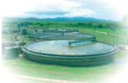
Primary Settling Tank

In the Primary Settling Tanks (also called Primary Clarifier), larger particles of organic matter (called raw sludge) settle to the bottom. These then are removed from the tanks by a Rotating Submerged Raking System to a central hopper and then it is discharged to a Raw Sludge Well. From the well, the sludge is pumped to two Anaerobic Digesters for further treatment.